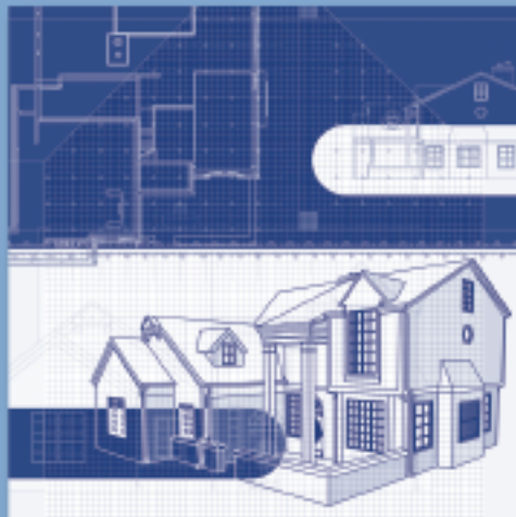
Photo-quality images print fast, too. Produce a full-color, high-resolution, A0-sized (10.76 ft. 2 ) image in under five minutes.