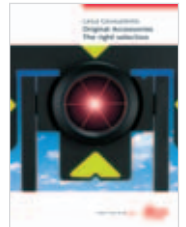
Leica Accessories Product brochure