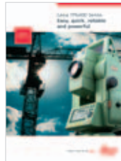
Leica TPS400 Product brochure

The Bluetooth® word mark and logos are owned by Bluetooth SIG, Inc. and any use of such marks by Leica Geosystems AG is under license. Other trademarks and trade names are those of their respective owners.