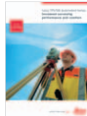
Leica TPS700 Product brochure