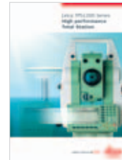
Leica TPS1200 Product brochure